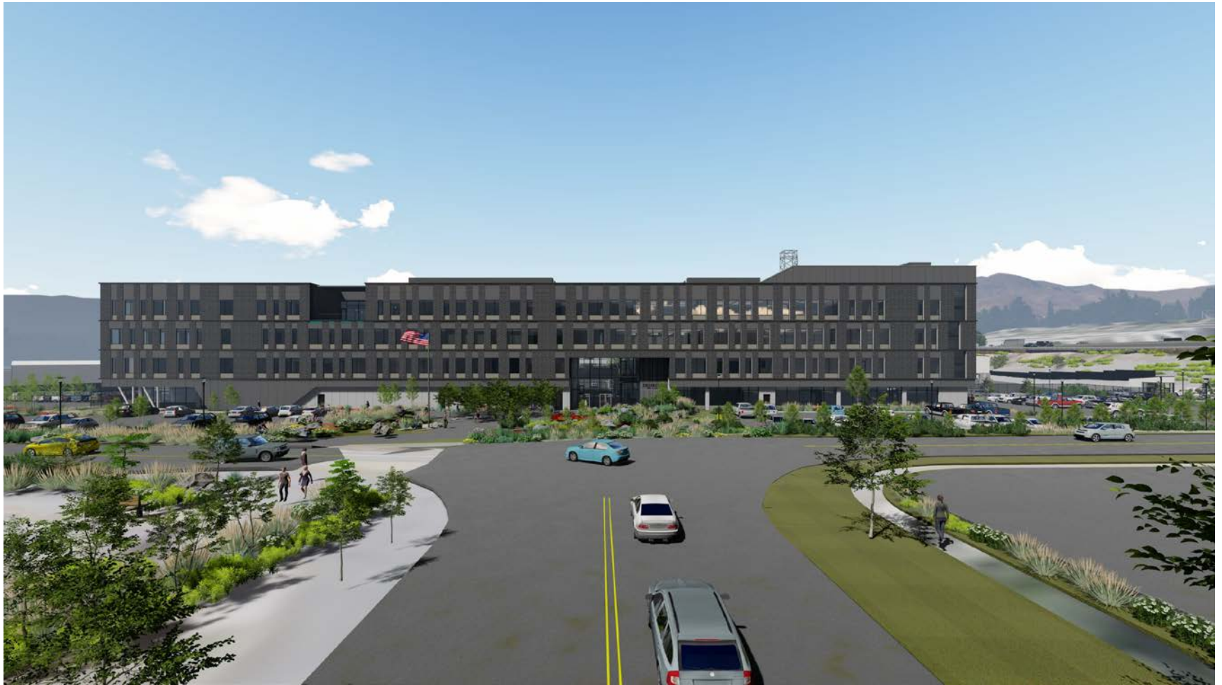
Building A – Looking South