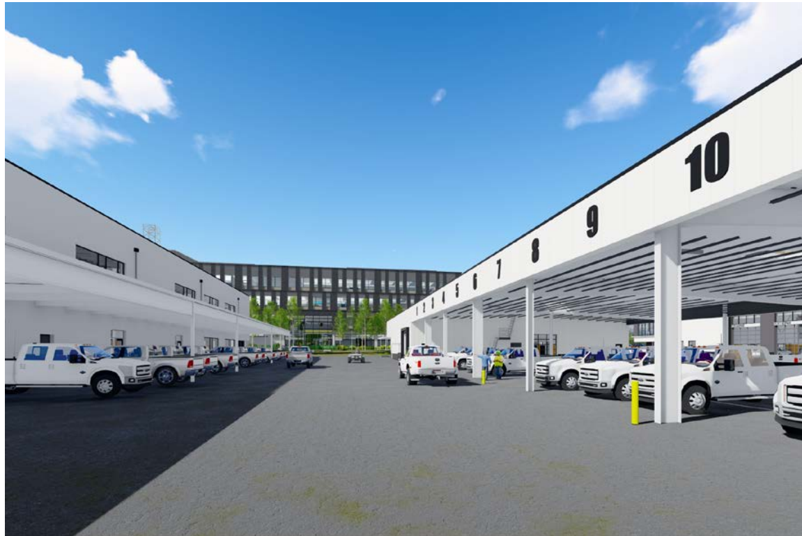
Operations Yard – Looking North