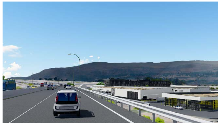
Highway View – Looking North