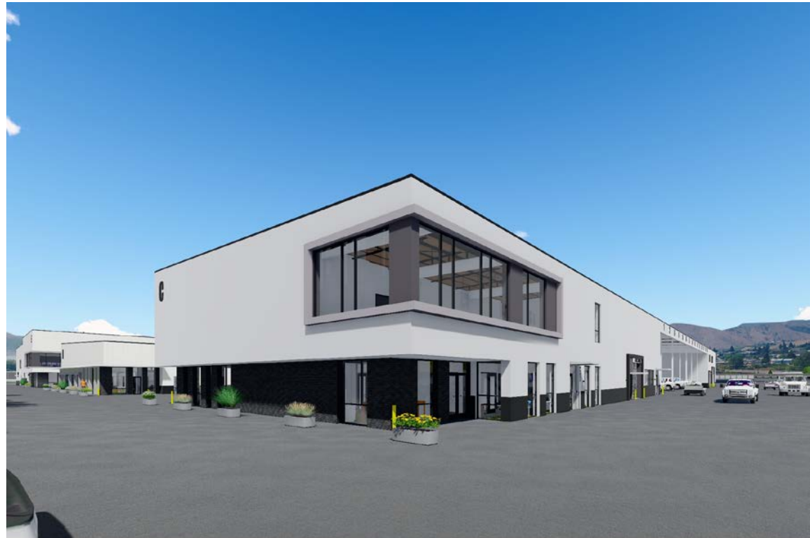
Operations Yard – Building C