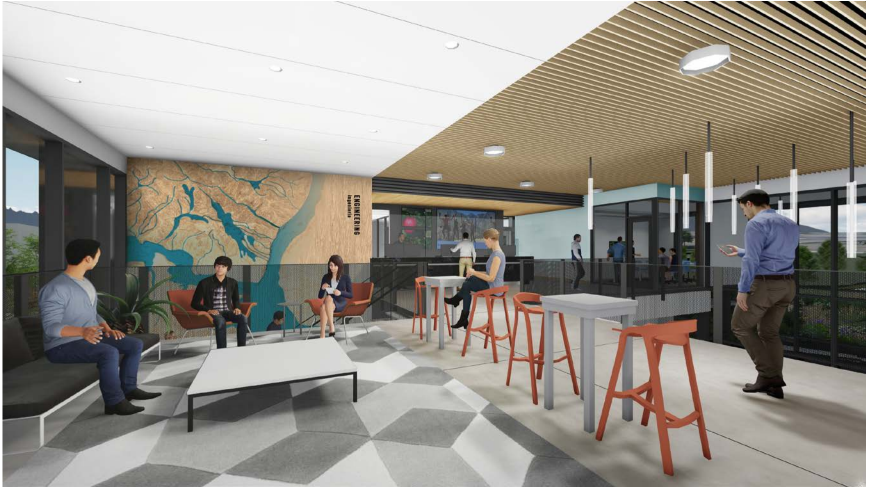
Customer Lobby – Level 2