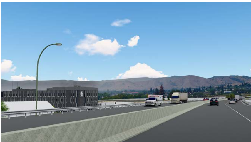
Highway View – Looking South