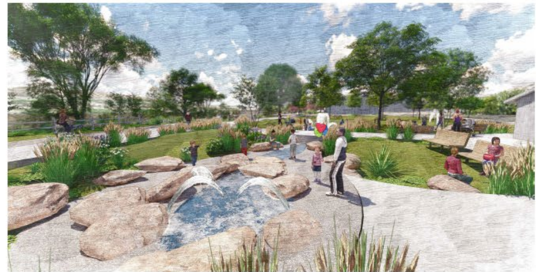
CLOSE UP OF SPLASH PAD