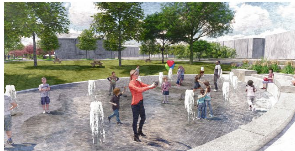
CLOSE UP OF SPLASH PAD