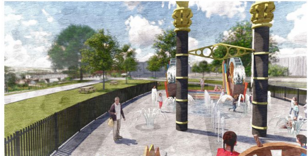
CLOSE UP OF SPLASH PAD