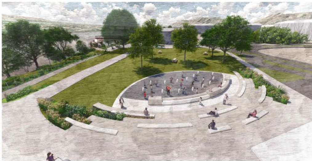
AERIAL VIEW OF SPLASH PAD AREA LOOKING SOUTH