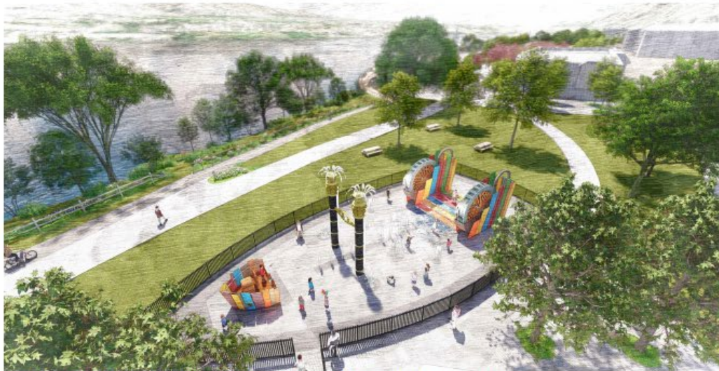
AERIAL VIEW OF SPLASH PAD AREA LOOKING SOUTH