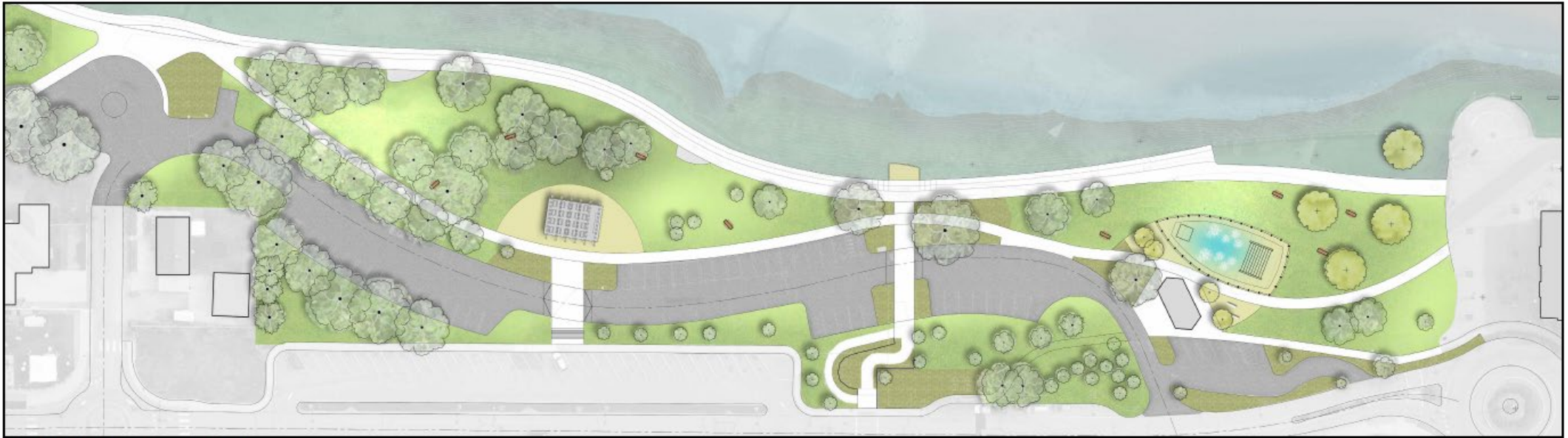
PLAN VIEW - OPTION #2