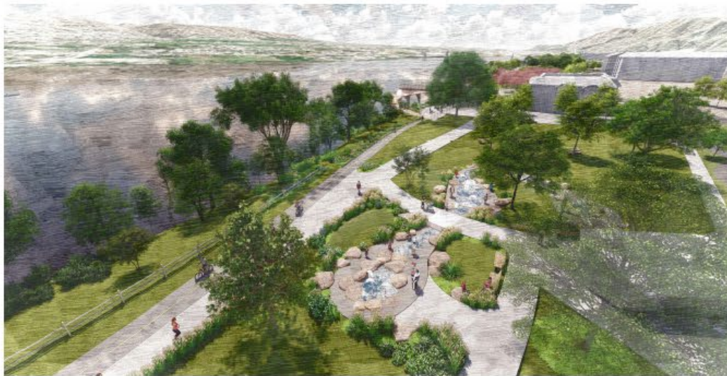
AERIAL VIEW OF SPLASH PAD AREA LOOKING SOUTH