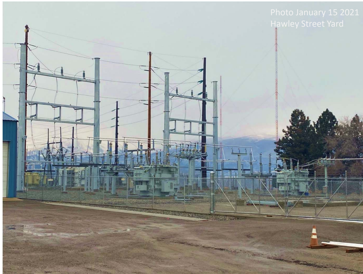
Photo January 15 2021 Hawley Street Yard