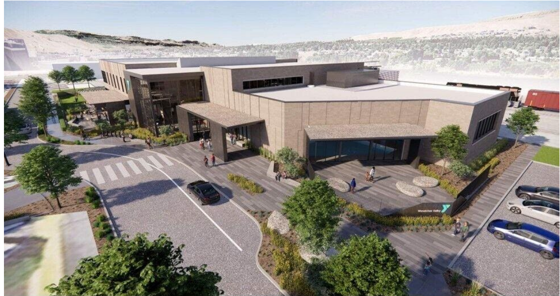
Rendering new YMCA