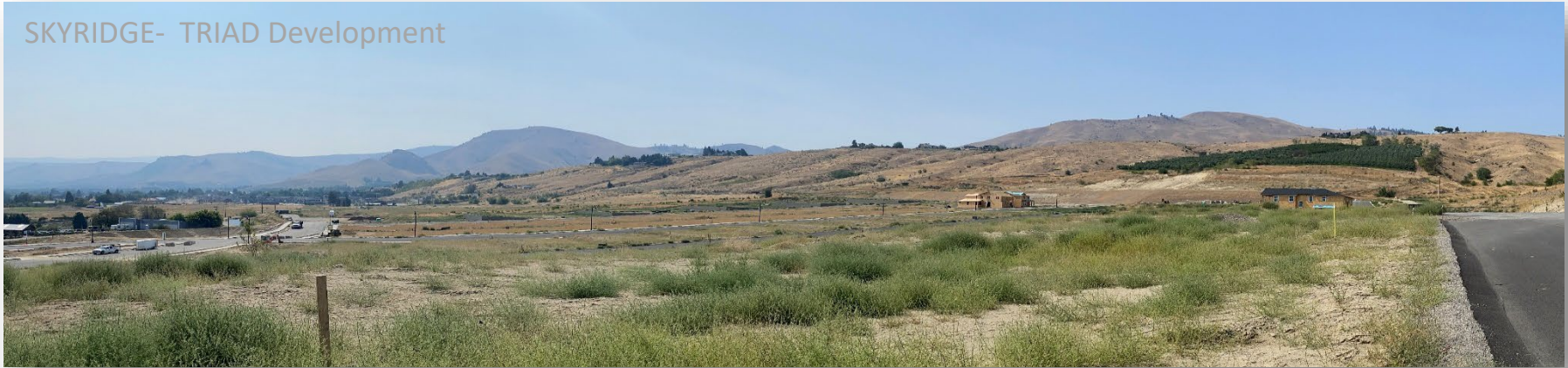
SKYRIDGE- TRIAD Development