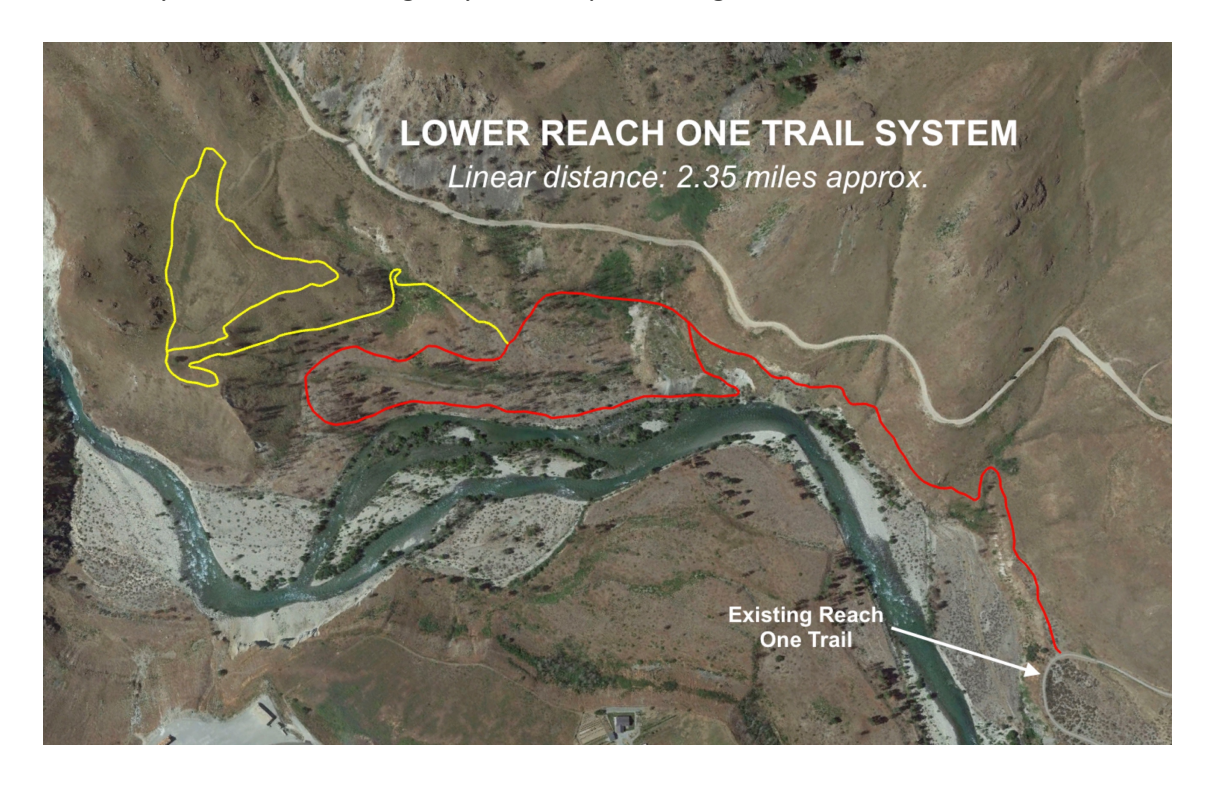
See appendix for larger format map

The Lake Chelan Trails Alliance (LCTA) offers the enclosed layout and design of the trail for mutual approval by the City and CCPUD. LCTA will be the lead in trail permitting (SEPA, etc.). Chelan County will be the lead agency in SEPA processing.