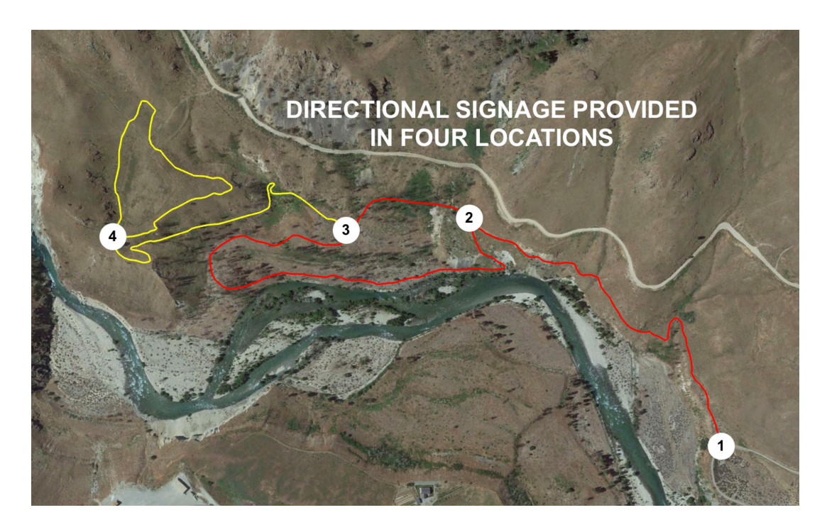
Four Sign Locations