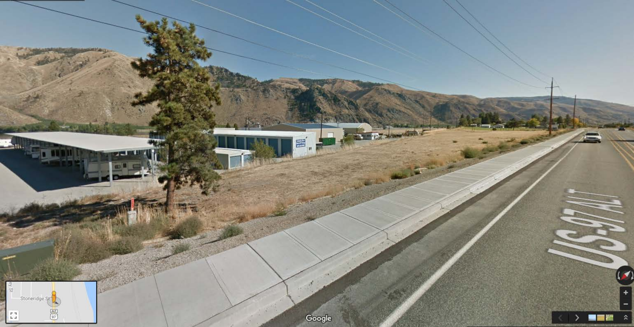
Looking South Along Hwy 97