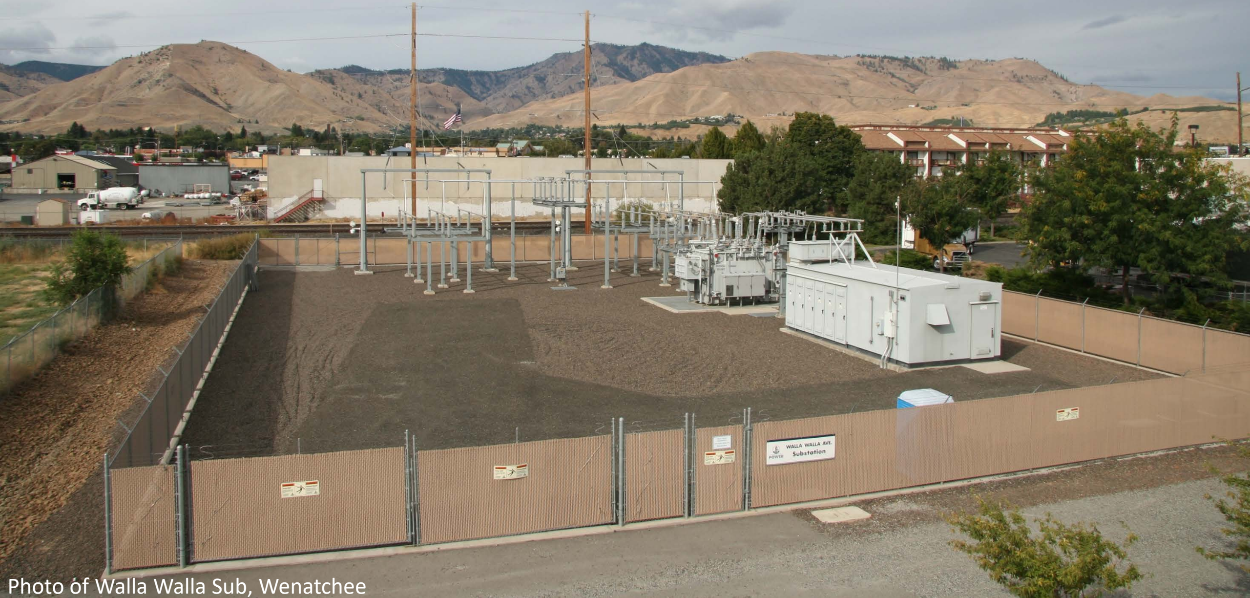
Photo of Walla Walla Sub, Wenatchee