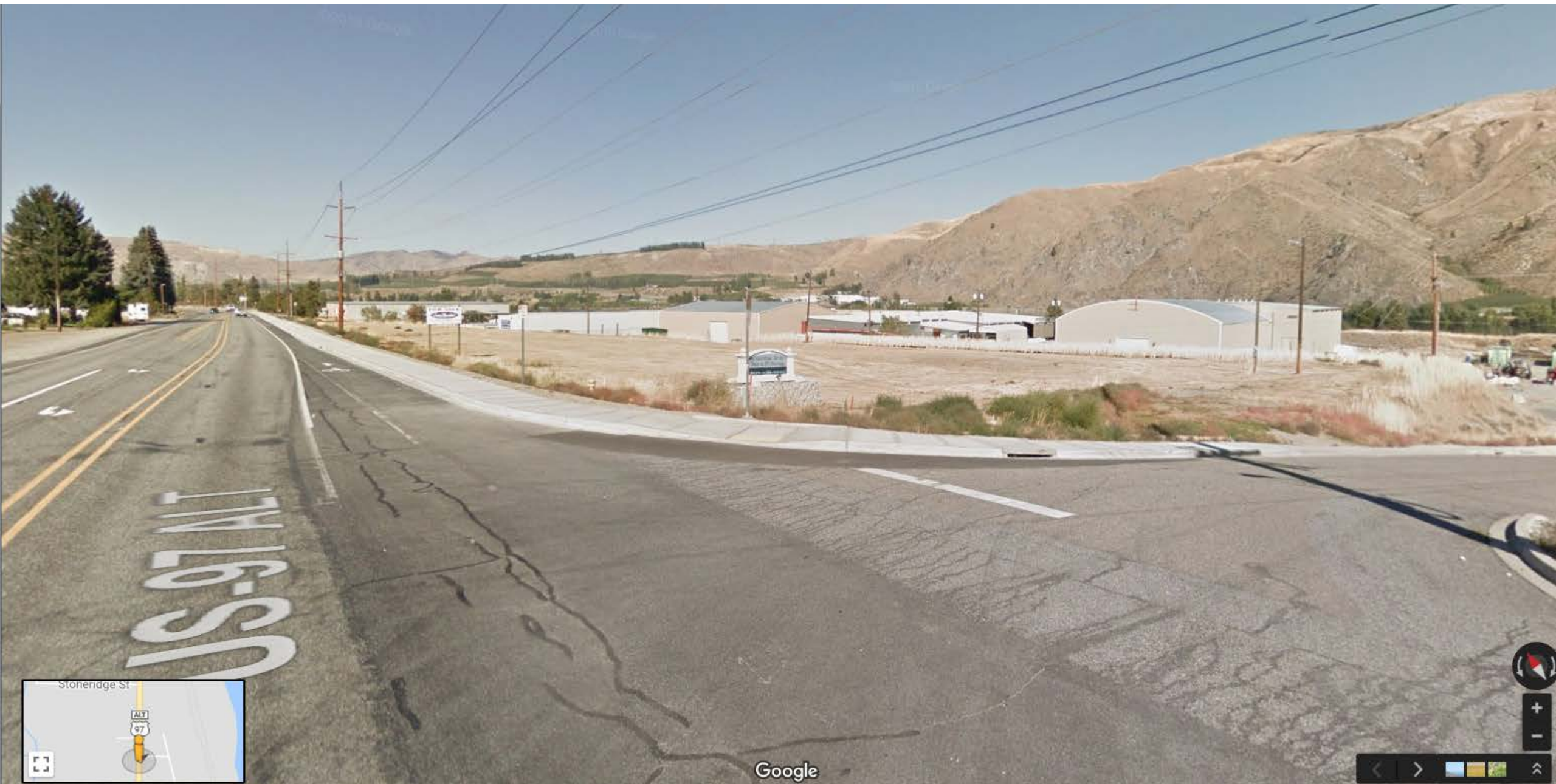
Looking North Along Hwy 97