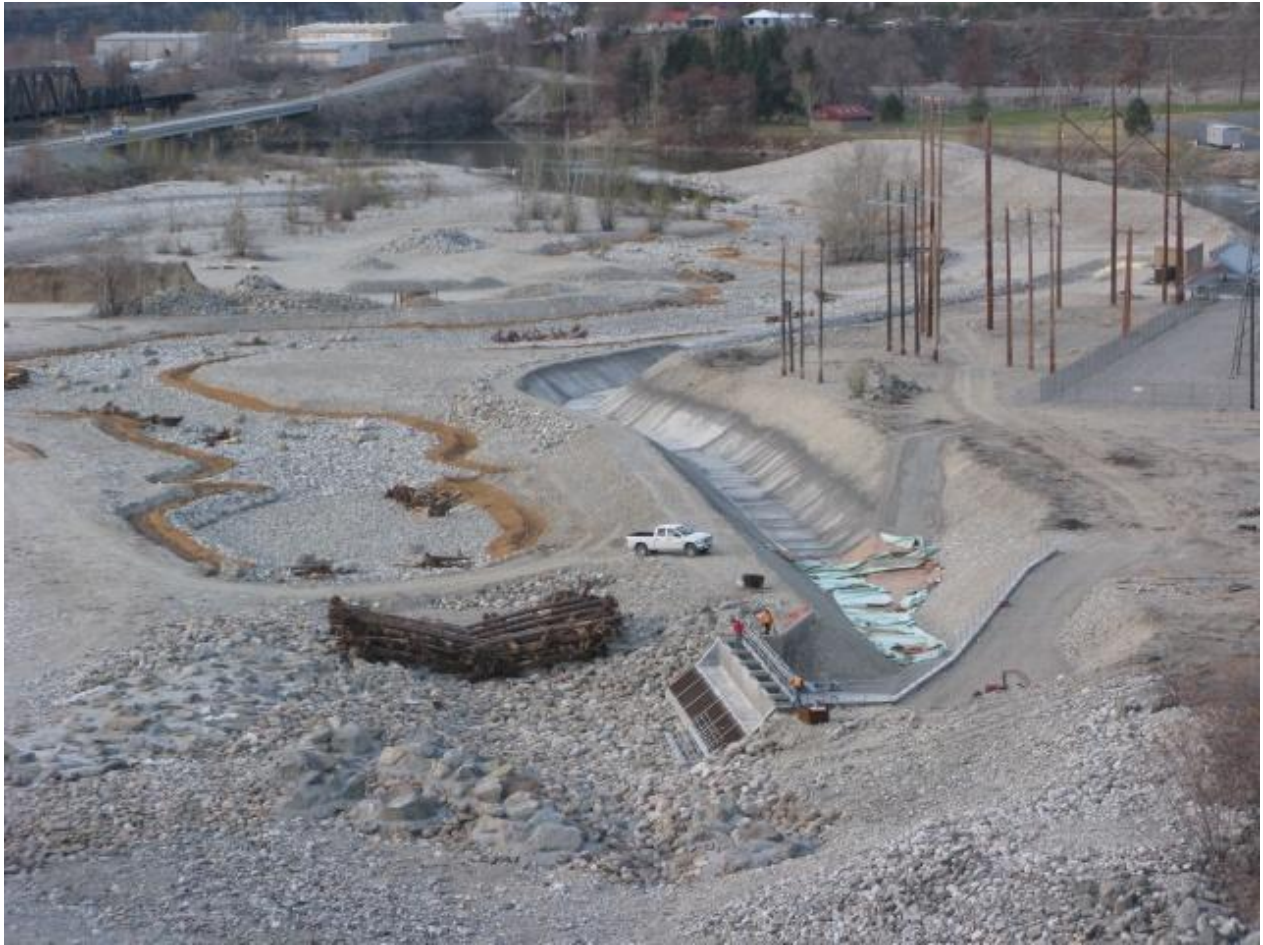
This is a close-up photograph of Reach 4 with the constructed - riparian zone fabric (brown in color) in place. April 10 th , 2009.