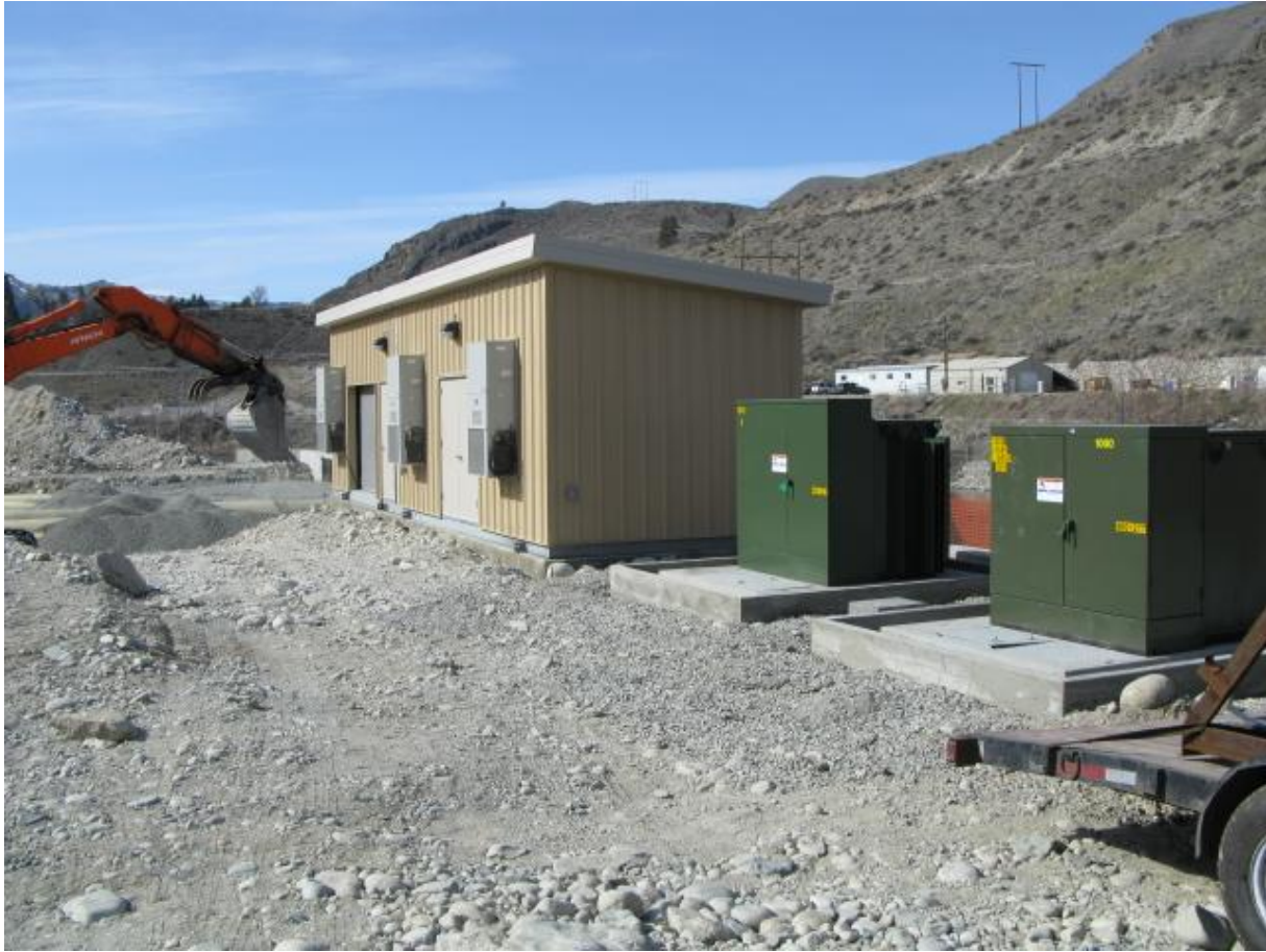
Picture taken on 3/27/09 showing the two control building modules residing on their foundations, and also the two transformers, complete with the poured-in-place concrete oil-spill containment trays.