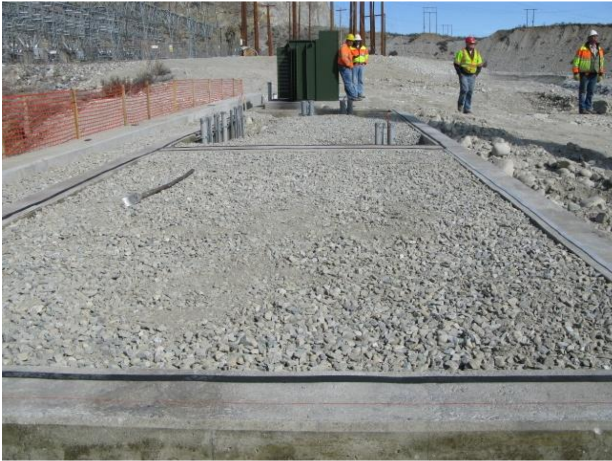
Picture taken on 3/17/09. This is a photo of the backfilled interior portions of the pump station control building foundations. Notice the conduits extending above grade; these will eventually be encased within the concrete floor of the control building.