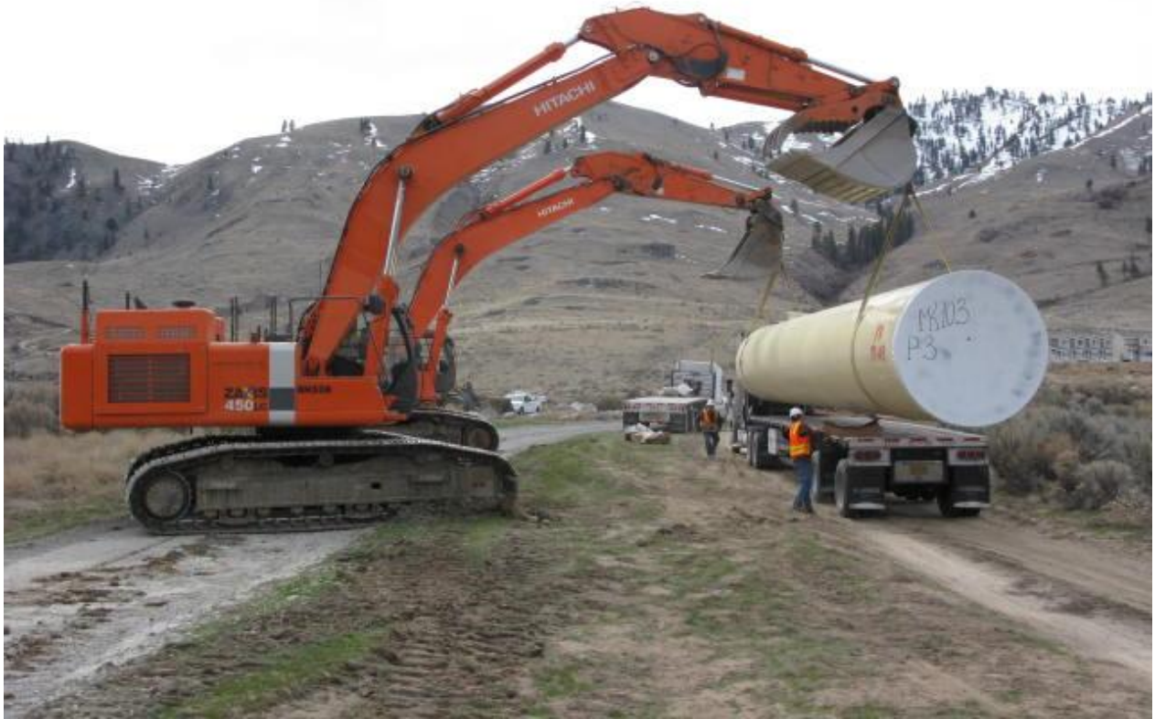
This picture was taken on 3/24/09. The two track excavators are offloading a section of the 84" diameter LLO pipe.