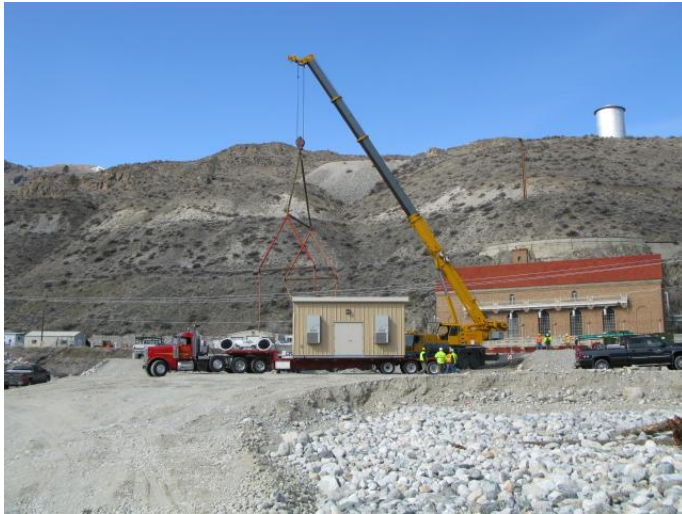
Pictures above and below were taken on 3/17/09 of control buildings being offloaded by the contractor and set at their final destination at the Chelan River Project location.