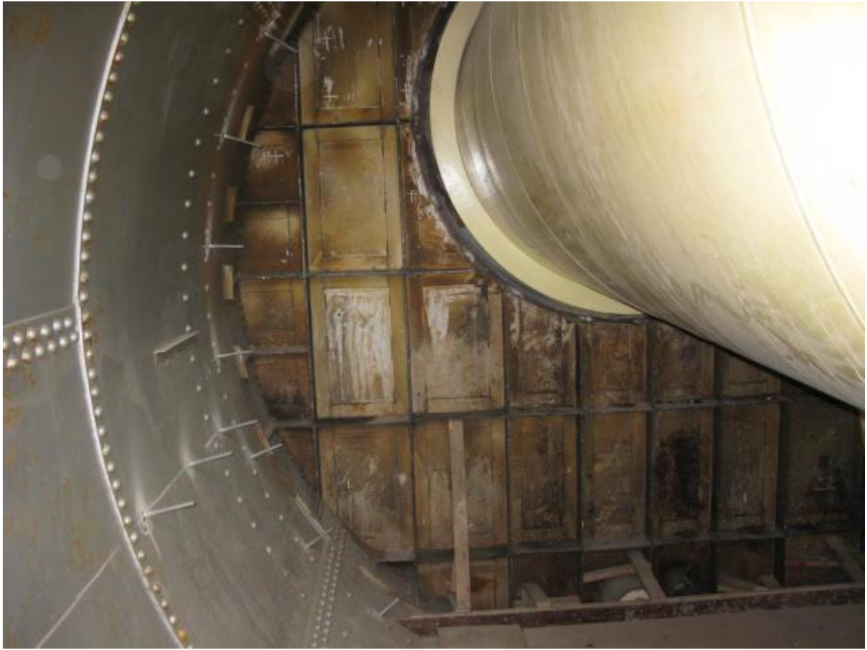
This view is the downstream side of the existing bulkhead within the 17' diameter penstock, and the penetration through it with the new 84" diameter LLO piping. Picture taken on 4/8/09.