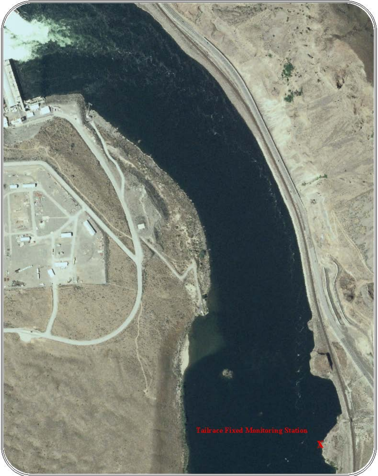
Figure 3-2: Location of tailrace fixed monitoring station below Rock Island Hydroelectric Project.