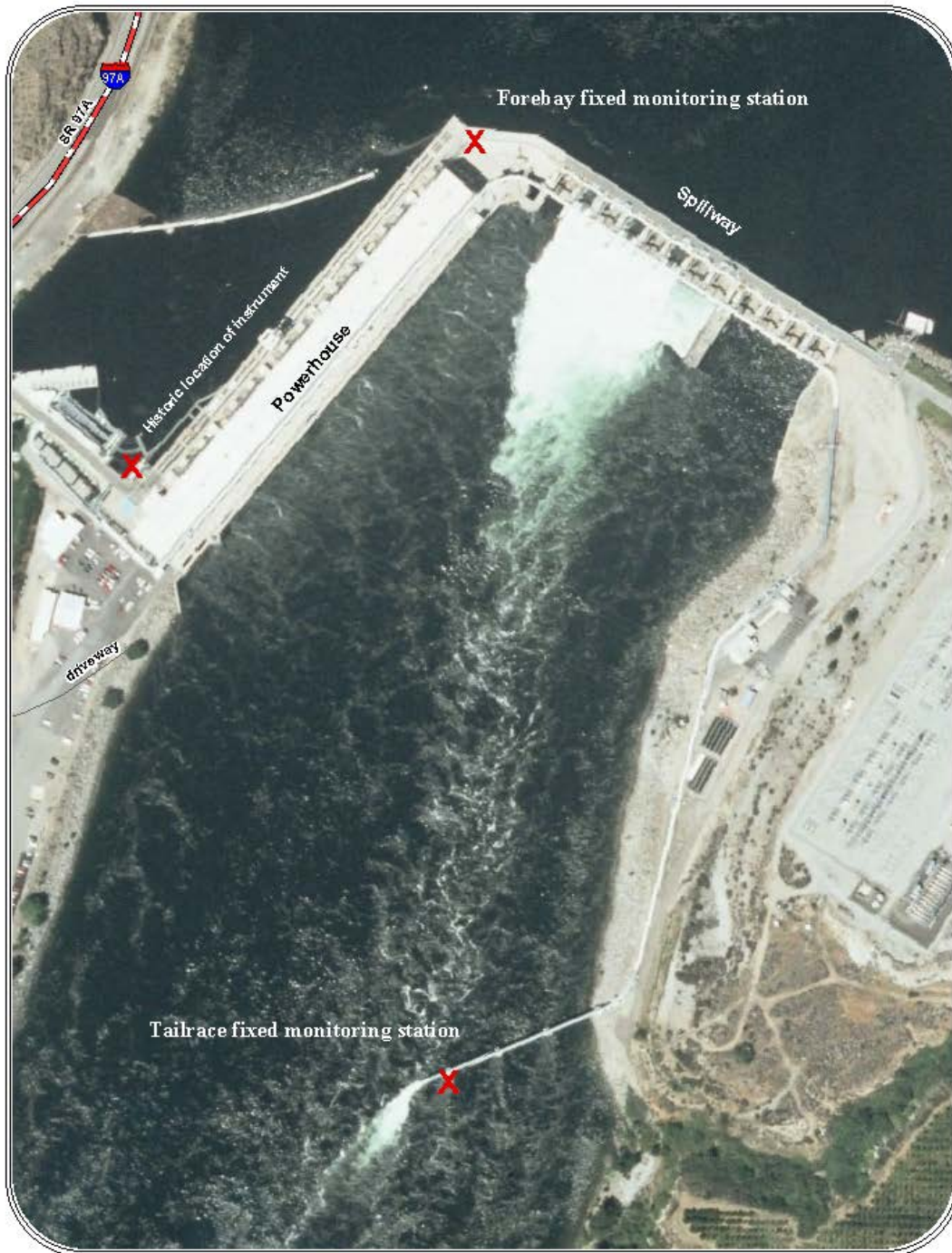
Figure 3-1: Location of forebay fixed monitoring station at Rocky Reach Hydroelectric Project.