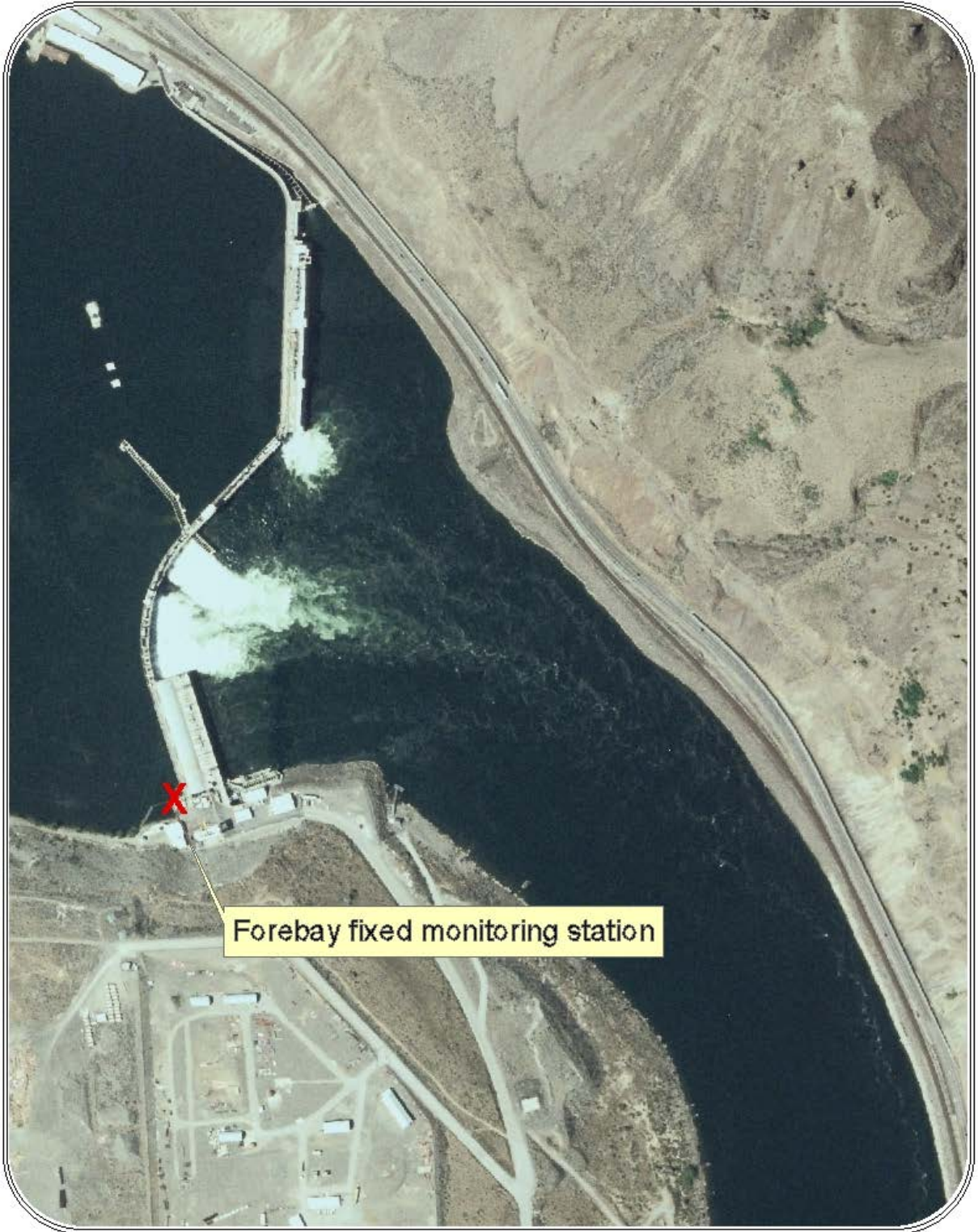
Figure 3-1: Location of forebay fixed monitoring station at Rock Island Hydroelectric Project.