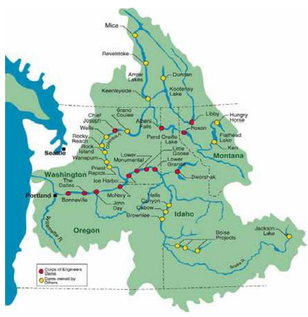
Figure 1. Location of Rocky Reach Hydroelectric Project on the Columbia River.