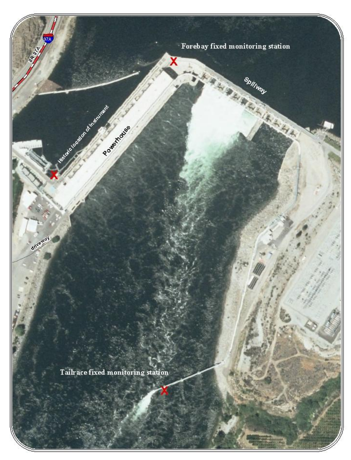
Figure 2. Location of forebay and tailrace fixed monitoring stations at Rocky Reach Project.