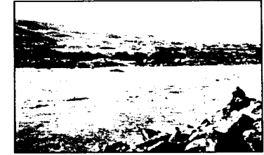
Foster Creek Rapids