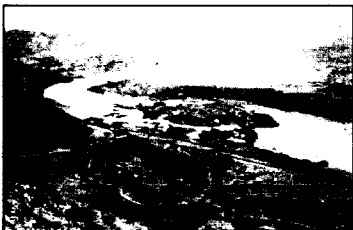
Rock Island Rapids