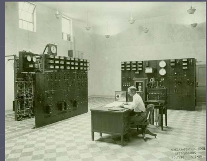
Chelan Powerhouse Control Room 1928. Original panels still in use