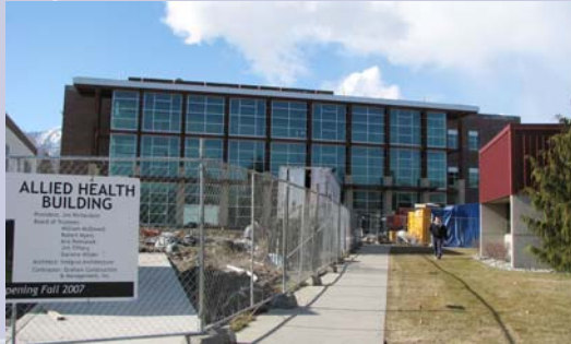
Allied Health Building