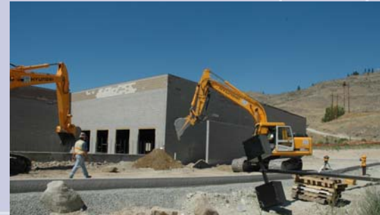
Wal Mart, Chelan