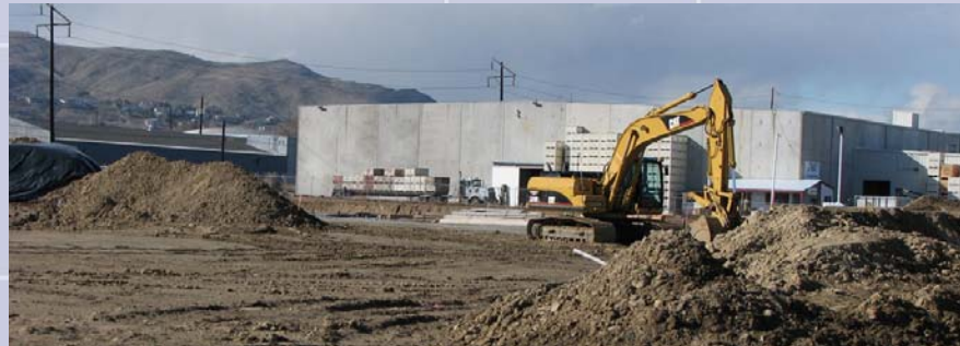
Wenatchee Events Center