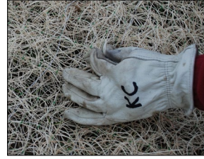
Erosion control mat.

Trail users can help prevent the spread of noxious weeds by staying on the permitted trail, keeping off restored areas and removing seeds from clothes and pets before leaving trailheads. Tread lightly, and don't cut switchbacks. Your conservation efforts are vital to making sure public access to the Home Water Wildlife Preserve continues.