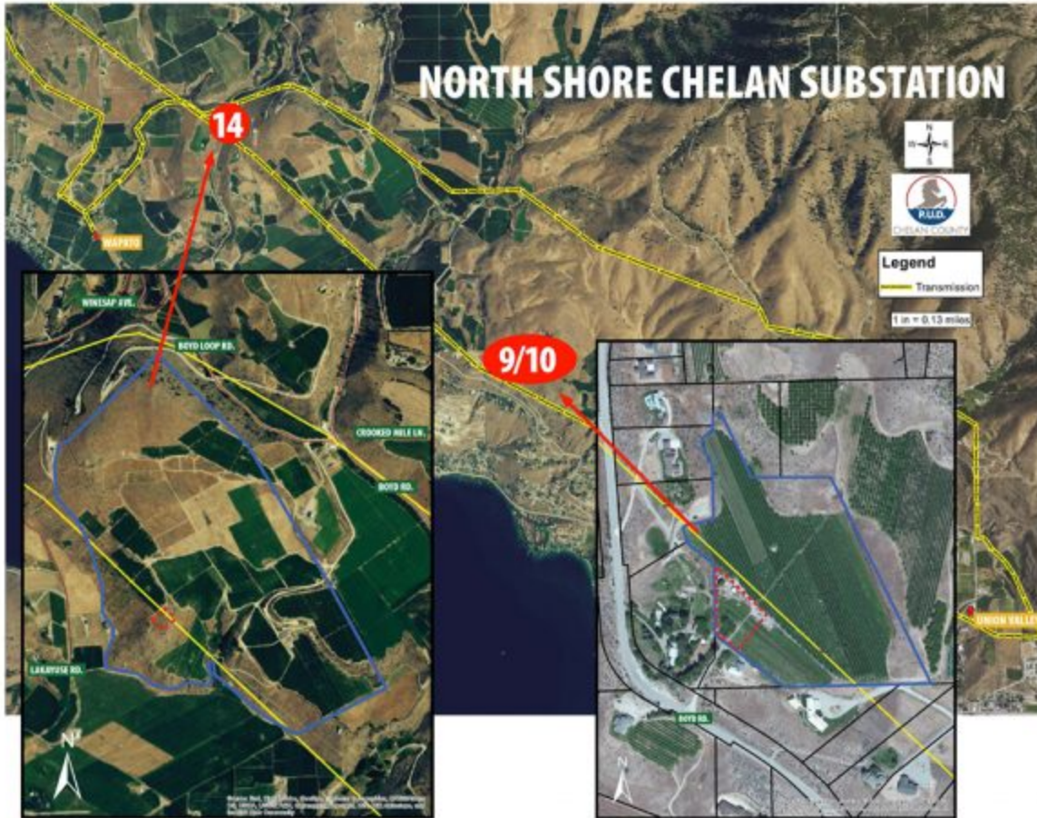
A map showing the two proposed sites for the Chelan County PUD North Shore Substation. One location is near the intersection of Boyd Loop Road and Winesap Avenue, and the other is located at 54 Boyd Road.