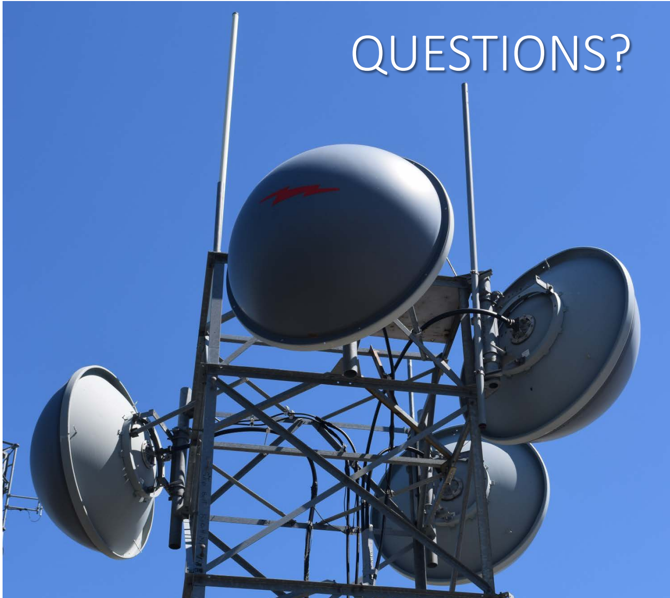
Burch Mountain Microwave/Radio Tower