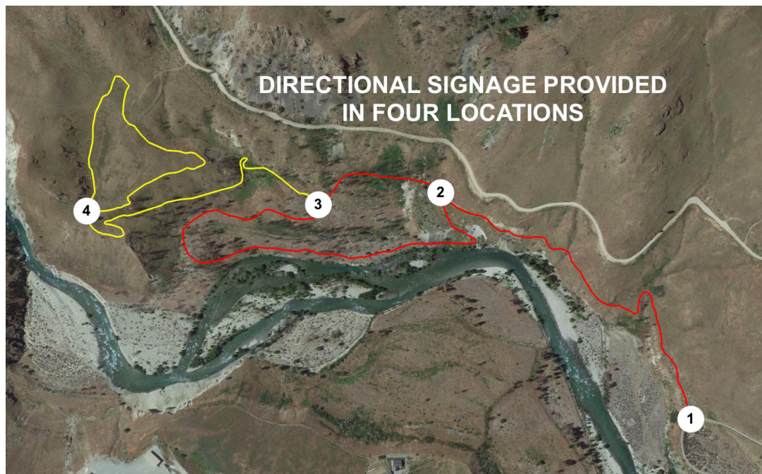
Four Sign Locations