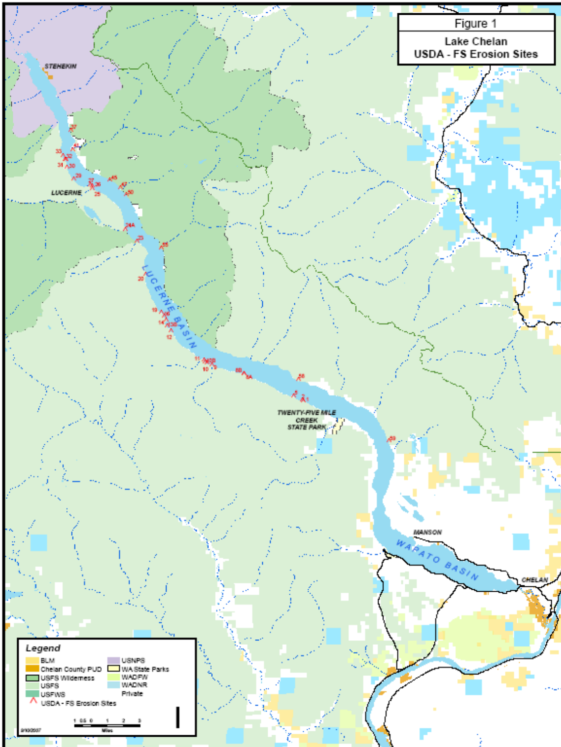
Figure 1: Erosion Sites