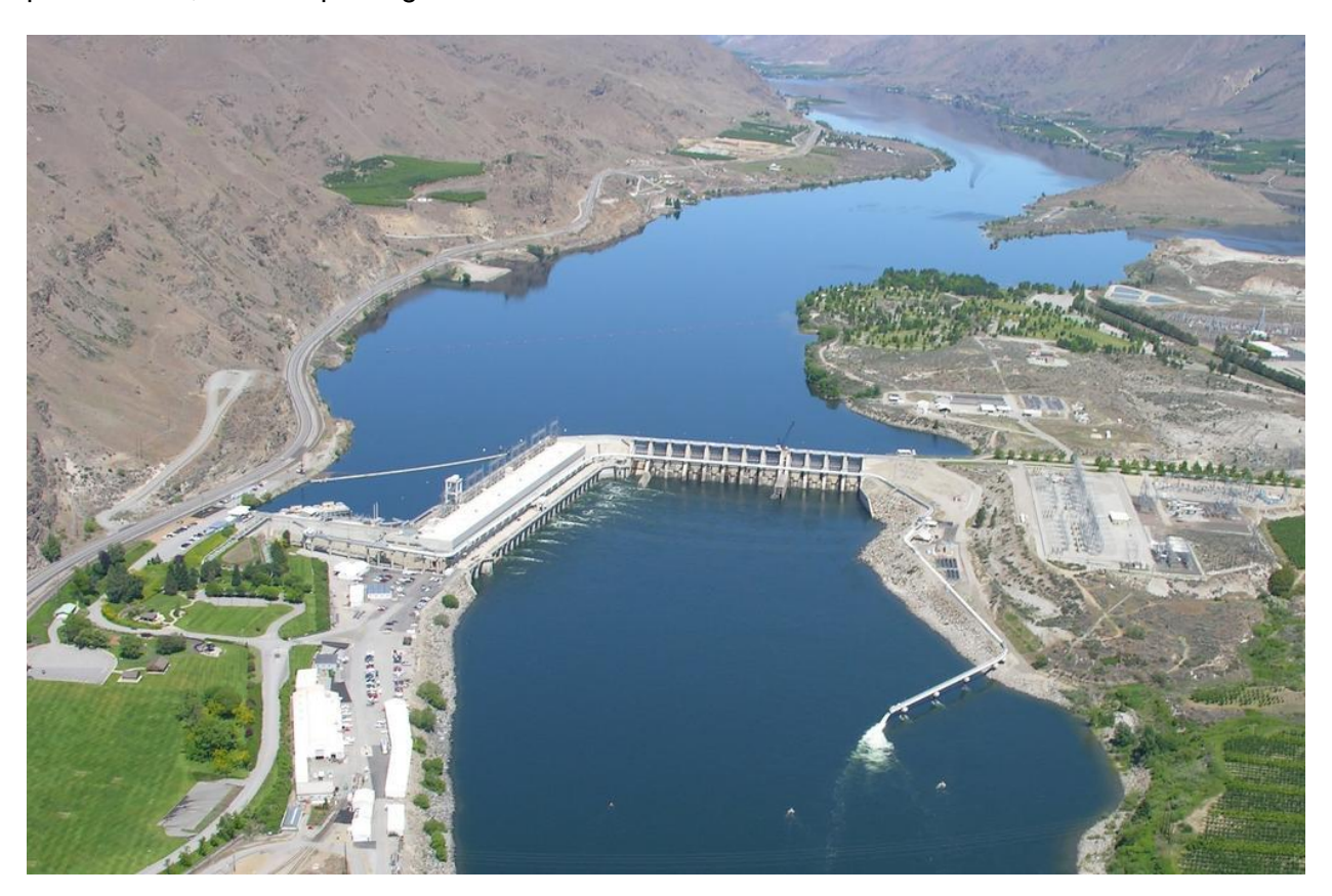
Figure 2. Rocky Reach Dam.

passage facilities are included in the dam, passing through several of the other structures. Key components of the dam related to TDG management include the spillway and its' operations, powerhouse, and fish passage facilities. These elements are described in more detail below.