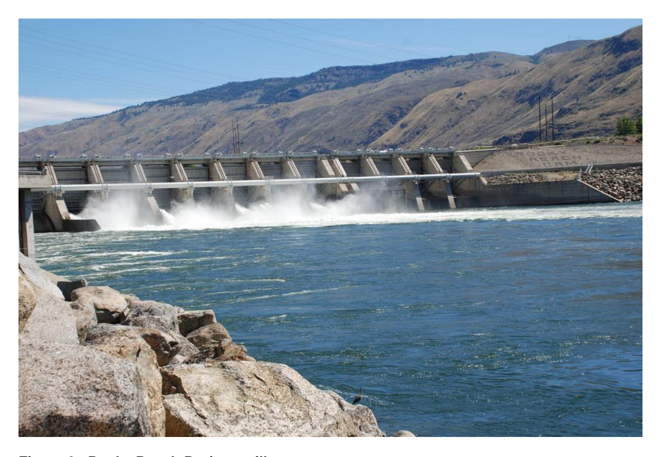
Figure 3. Rocky Reach Project spillways.